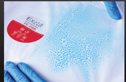
Type 6B and 5B certified standard