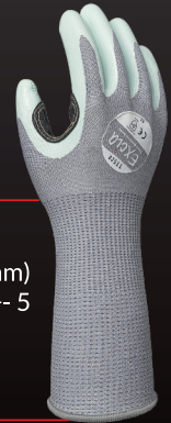
Wrist length (mm) 180+ 5